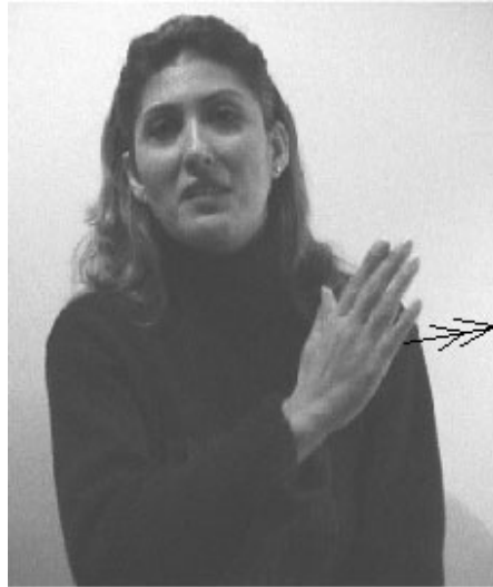
Figure 4. Noncomplete form of ГИТМЕК ‘go’