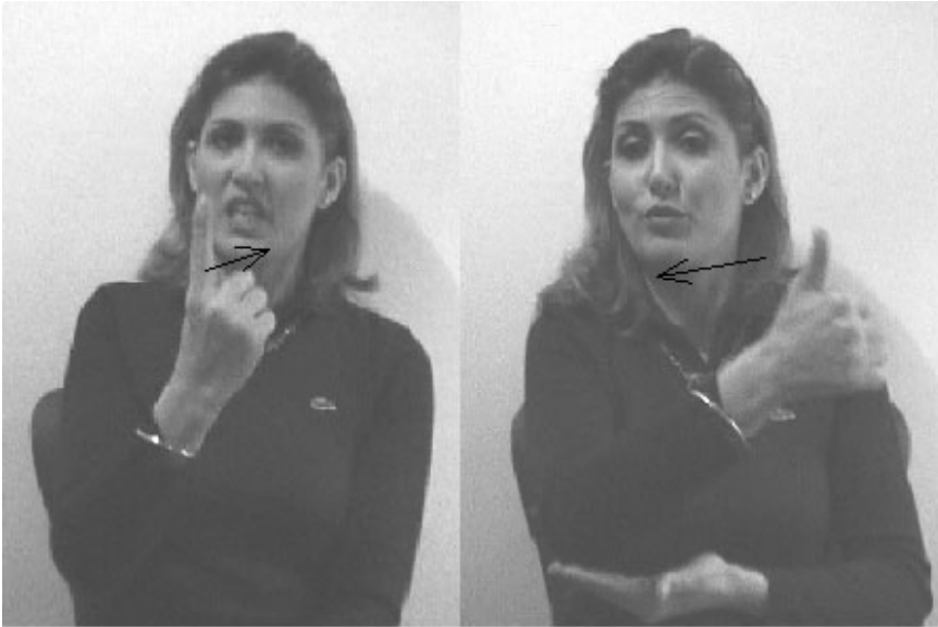
Figure 9. Nonhonorific and honorific person classifier

system includes an honorific classifier. Honorific classifiers can be found in various spoken languages. For example, in the Mayan language Jacalteco, the classifier ya7 is used for ‘respected humans’ (Aikhenvald 2000: 284). In Japanese, classifiers used with numbers or counting (‘numeral classifiers’) include the superordinate nin for human beings in general and the subordinate mei for human beings in an honorific sense (Aikhenvald 2000: 317). In sign languages, honorific classifiers have not been described so far.