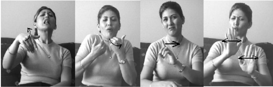
Figure 7. Negators DEĞİL ‘not’, OLMAZ ‘cannot’, HAYIR ‘no’, YO ‘no-no’

counterexamples can be found for all negative items (see example 14a in Section 2.3 for an instance of DEĞİL accompanied by a headshake). More research is needed to determine the exact nature of the co-occurrence constraints involved.