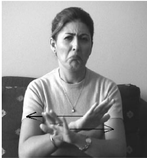
Figure 2. TAMAM ‘done, complete, ready’

TID does have two signs TAMAM ‘done, complete, ready’ and BITTI ‘finish(ed)’ (see Figures 2 and 3), which can be used to indicate completed action both at the sentence level (1), and at the discourse level, occurring at the end of a paragraph (2) or at the end of a text (3). Another sign OLMAK ‘be, become’ seems to have a related, resultative function (‘have become’), and thus mostly occurs with stative predicates (cf. example 15f in Section 2.3). The function of these three signs is not sufficiently clear yet. However, it does seem that for the most part, manual signs indicating completedness are limited to contexts that are compatible with a more literal reading of ‘finishing, completing.’