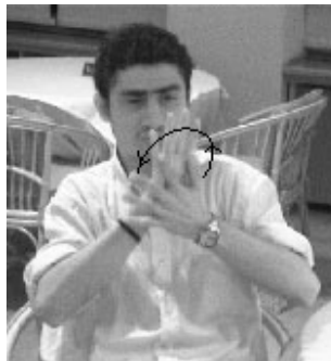
Figure 1. İŞARET ‘sign’

With regard to hearing status, TID signers frequently use distinct terms for three