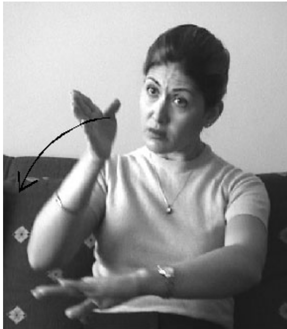
Figure 5. Complete form of ГИТМЕК ‘go’