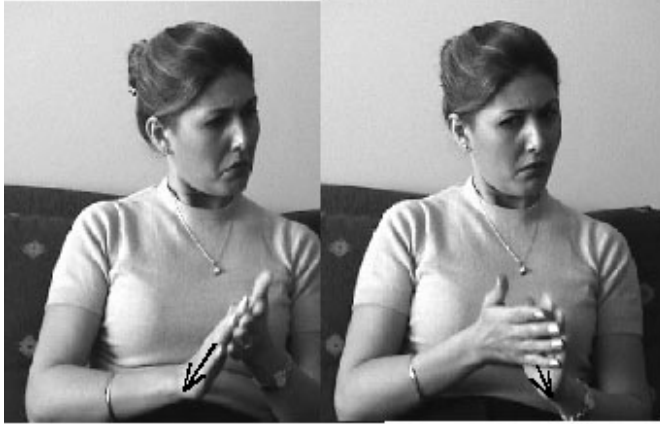
Figure 3. BITTI ‘finish(ed)’

On the other hand, the putative completive movement pattern quite commonly occurs with a wide range of predicates (of both the directional and the non-directional type). 1 Accordingly, the meaning of the movement pattern seems to be more abstract, conveying a general notion of completedness (4–6). Note that translations such as ‘finish seeing’, ‘finish going’, and so on, are not adequate to express the meaning of the predicates with the completive movement derivation.