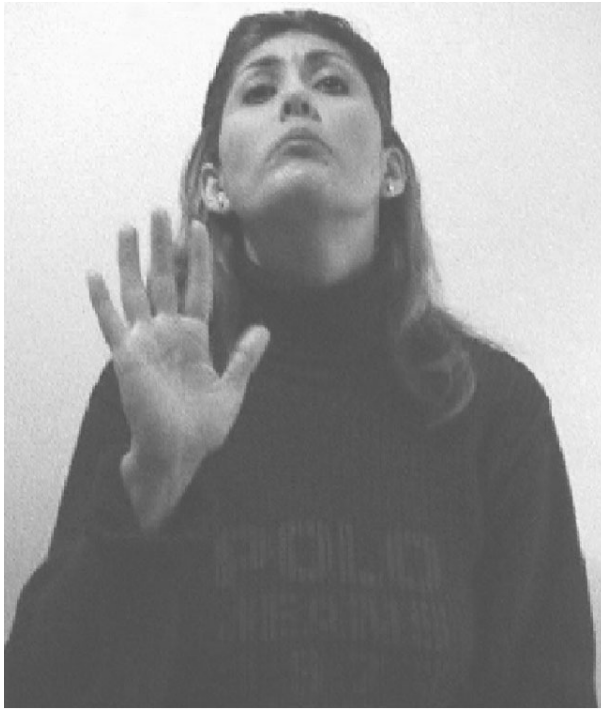
Figure 6. Backwards head tilt for negation

negators in particular have not been investigated sufficiently yet. However, some tendencies will be noted here that emerge from the available data.