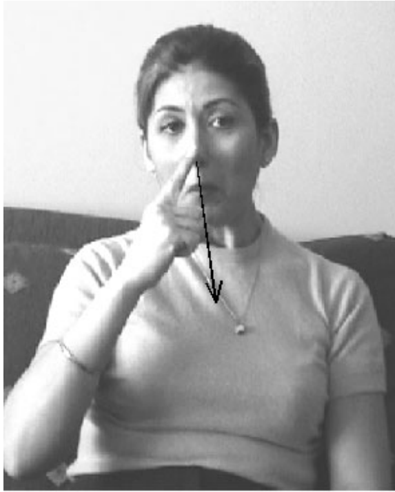
Figure 10. Question particle

and then moving downward in a straight line. A few signers optionally use this particle at the end of a yes/no-question in TID (19). At the same time, this sign is an old form of the sign NE ‘what’ in TID. Younger signers use a different sign for ‘what’ instead of the older sign. Both older and younger signers also use yet another sign for ‘what’ which is based on a common Turkish gesture. In its function as a question word, the sign in Figure 10 also appears in wh -questions, in particular in combination with the gesture-based sign for ‘what’, as in (20). The possible syntactic positions in this type of question remain to be investigated. There is evidently some degree of assimilation between the two signs at the end of (20), which results in the duration and the movement path of the old question word being much shorter compared to its use as a question particle in (19). The resulting combination is not unlike what one would expect for a sign language compound, but the exact nature of this combination has not been determined yet.